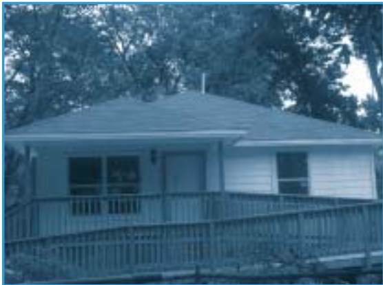
Accessible home rebuilt by GHURC

Attorneys from the law firm of Jones Day in Houston have formed a Community Counsel partnership through Texas C-BAR with the Greater Houston Urban Redevelopment Corporation (GHURC). GHURC is a nonprofit formed in 1993 to encourage the redevelopment of northeast Houston by creating affordable housing, business development, and job