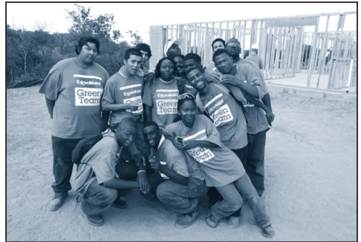
Builders of Hope Youthbuild Project